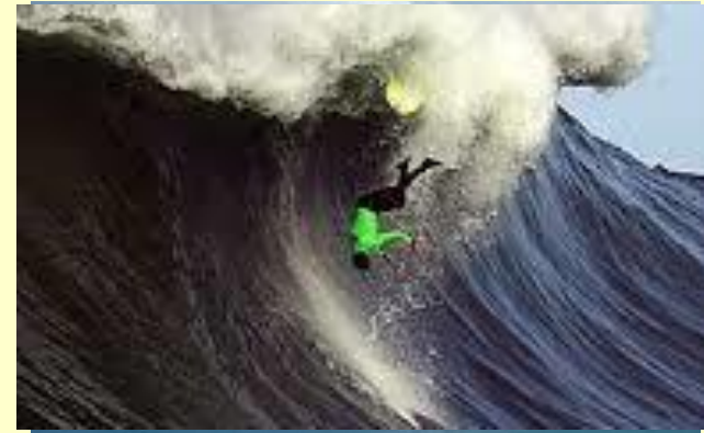
Beyond big data